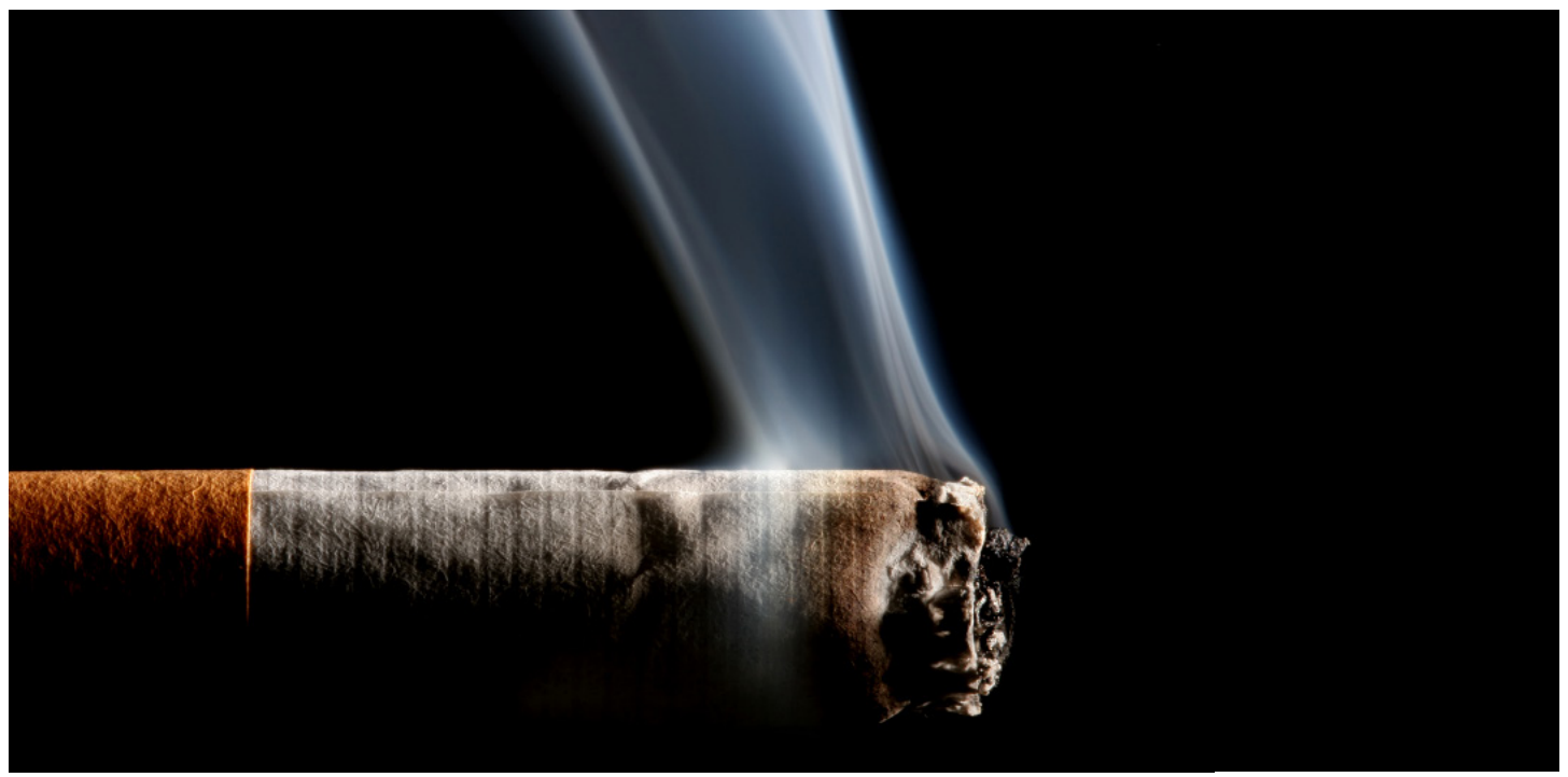
(Continued on page 10)

The Spotlight report highlights lung cancer screening as an important earlier NIH disease prevention success story that has improved outcomes for Americans with lung cancer. The report notes that the National Cancer Institute's National Lung Screening Trial (NLST) helped provide the evidence base for the U.S. Preventive Services Task Force's (USPSTF) to revise its statement on lung cancer screening in 2013 to recommend low-dose computed tomography (LDCT) annually for adults between the ages of 55 and 80 with a history of smoking.