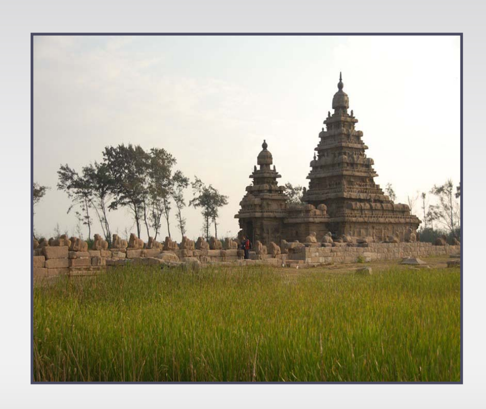
Temples of Mahabalipuram